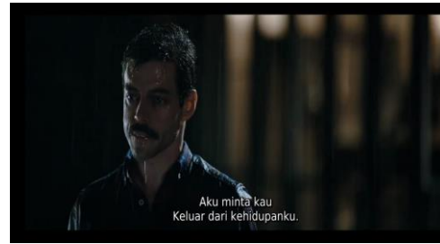
Figure 9. Freddie asked Paul to leave his life.

Data9#: Freddie asked Paul to leave his life for not telling him about Queen's concert plans at Live Aid. (01:34:30 – 01:34:33)