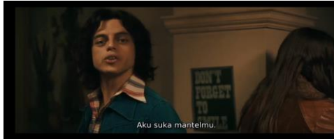
Figure 1. Freddie meets Mary Austin for the first time.

Data#1: Heterosexual orientation when Freddie Mercury tries to compliment Mary Austin at minutes (00:07:12 – 00:07:35)