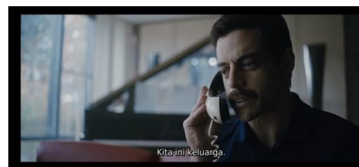
Figure 10. Freddie calls the manager about Live Aid concert.

Data10#: Freddie contacted Queen's manger about a concert at Live Aid and asked him to meet the other Queen's member. (01:37:20 – 01:37:38)