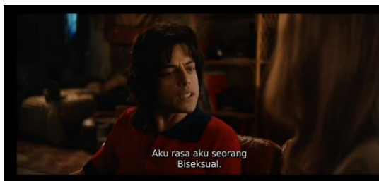
Figure 5. Freddie tells the truth that he is a bisexual.

Data#5: Freddie Mercury declared himself as a bisexual to Mary Austin, at minutes (00:54:20 – 00:54:24)