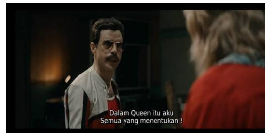
Figure 6. Freddie dominates every decision in the band.

Data6#: Freddie change the Queen genre, which was synonymous with rock, into a disco where all the member of the band did not like Freddie's decision (01:16:10 – 01:16:30)