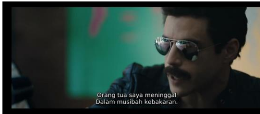
Figure 7. Freddie conducting interview with the media.

The figure above shown Freddie was conducting an interview with the media and asked several questions about his personal life. Media crews began to highlight Freddie's life with his male lovers and came to the questions about his parents. Freddie gave a surprising answer where he said his parents had died where it was just to save his own career.