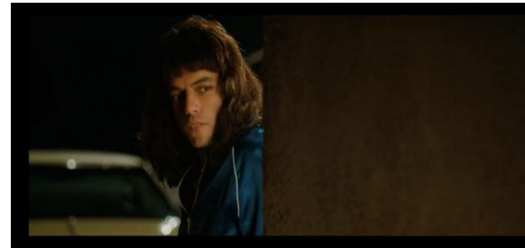
Figure 3. Freddie looks at the toilet after talked with Mary Austin.

Data#3: Bisexual orientation occurred when Freddie Mercury sees a man go to the toilet when Freddie talked with Mary Austin at the payphone. (00:29:10 – 00:29:24)